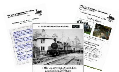
Miscellaneous items: ORANGE