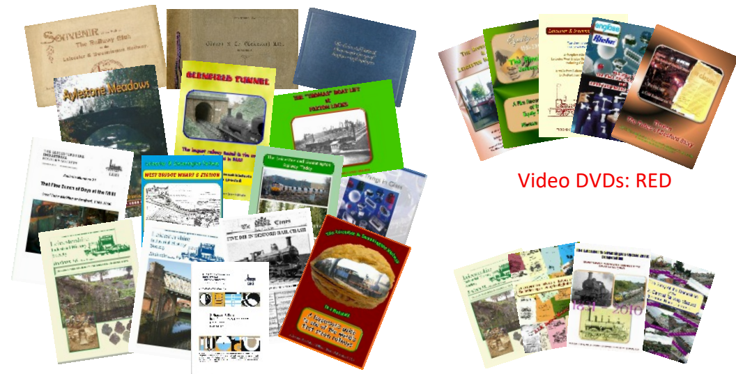
Video DVDs: RED