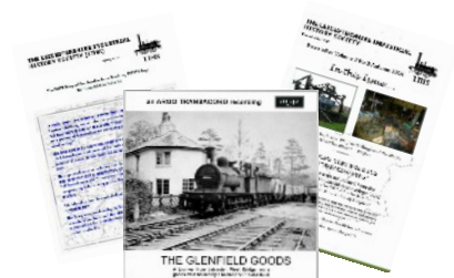
Miscellaneous items: ORANGE